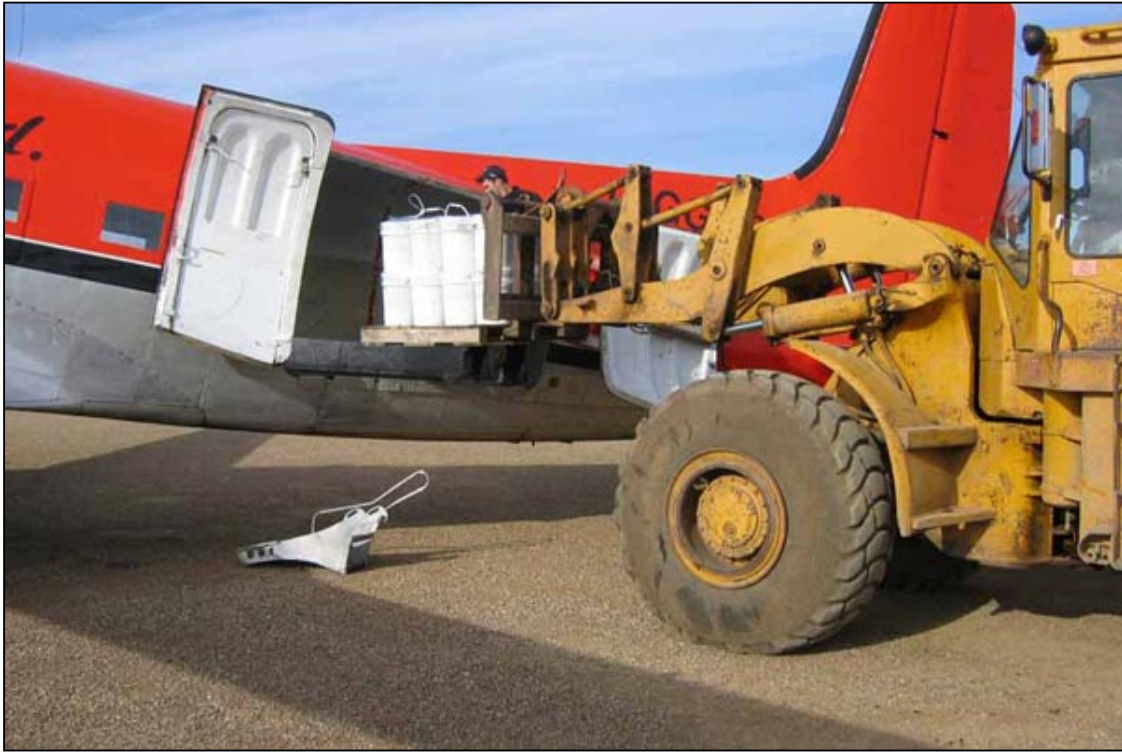
Loading till samples onto Aklak Airways DC3 for shipment to Inuvik and then by ground transport south for processing.