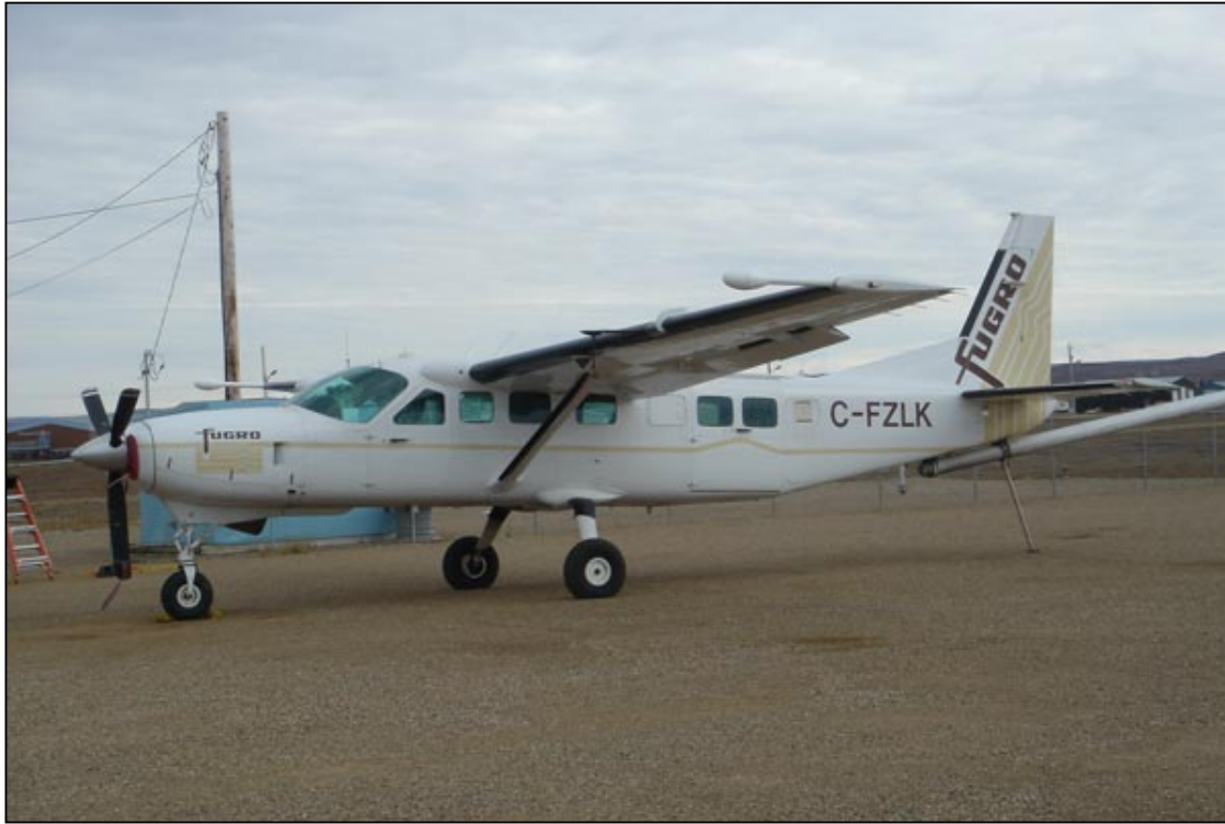
Fugro Airborne Surveys Cessna Caravan survey aircraft on the tarmac at Paulatuk.