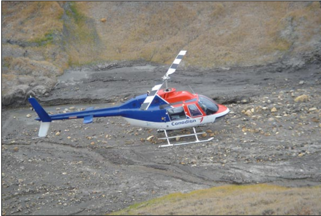
Canadian Helicopters 206B aircraft used to transport till sampling crew.