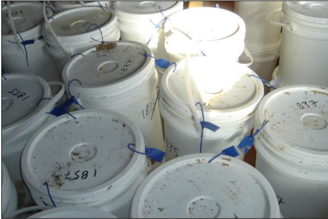
Till samples in 5 gallon pails with numbered security tags.