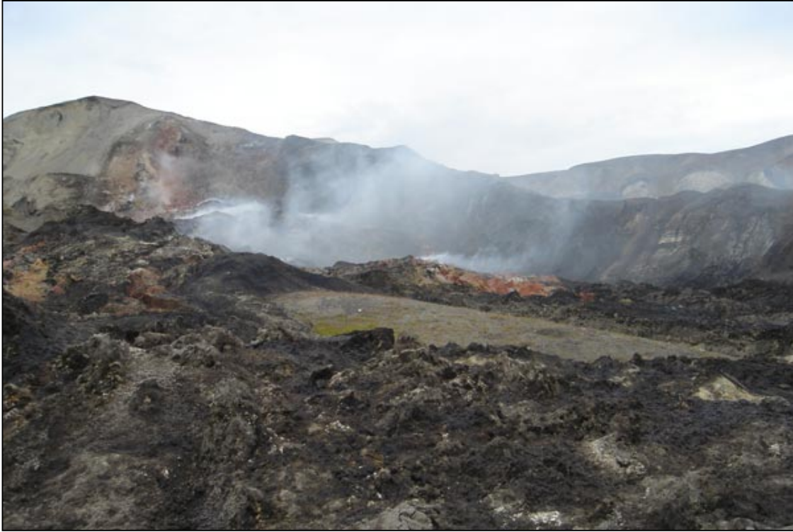
Smoking Hills area west of Paulatuk, spontaneously combusting coal seams in poorly consolidated Cretaceous sandstones and mudstones.