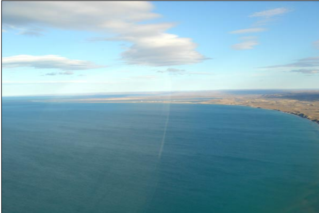
Hamlet of Paulatuk, Northwest Territories on the shores of Darnley Bay on the Arctic Coast.